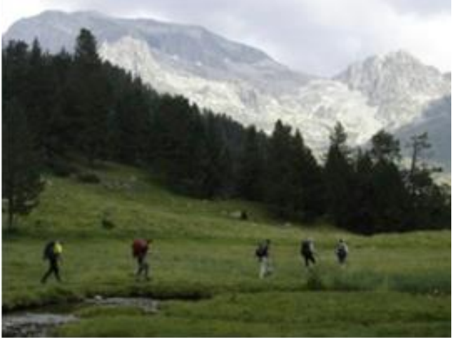
Day 3. Estós Hut (1.890 m) - Puerto de Chistau or Estós (2.700 m) - Biadós Hut (1.740 m).

After having a rest in this magnificent natural landscape surrounded by high mountains, we will start the ascent to Chistau Valley . Nice eastern view of Maladetas , with the Alba Peak in the first line. Descent towards Biadós mountain hut.